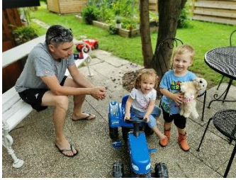
Playing with kids